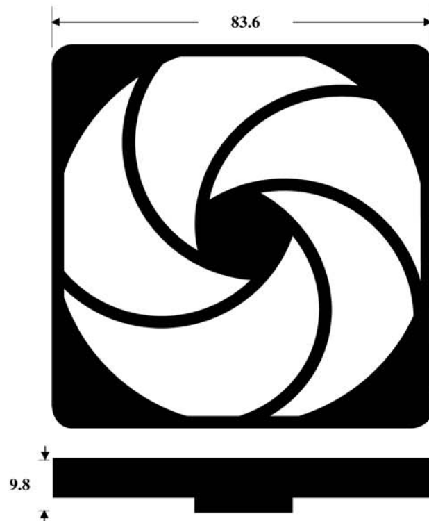
Guard "G" / G80P