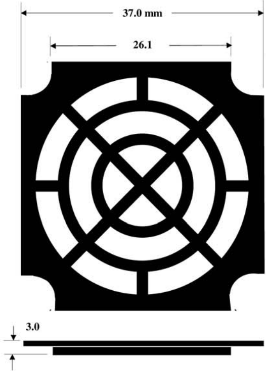
Retainer "R" / R40P